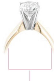
The colour should just fill the inside of the ring and no more.